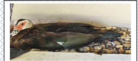
PASTOR'S PORCH DUCKS