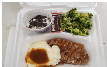
and Good Helpers