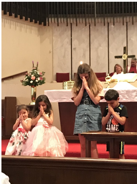
Precious Children's Moment