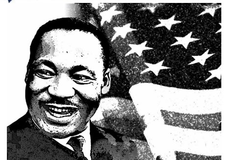
Martin Luther King Jr. Day