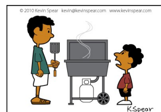
"How's the grilling? Should I call in pizza yet?"

Don't see your September birthday listed? Please let us know. Happy Birthday!