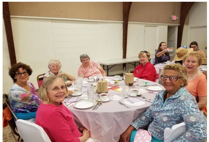
Thank you Troop 204 for serving us!