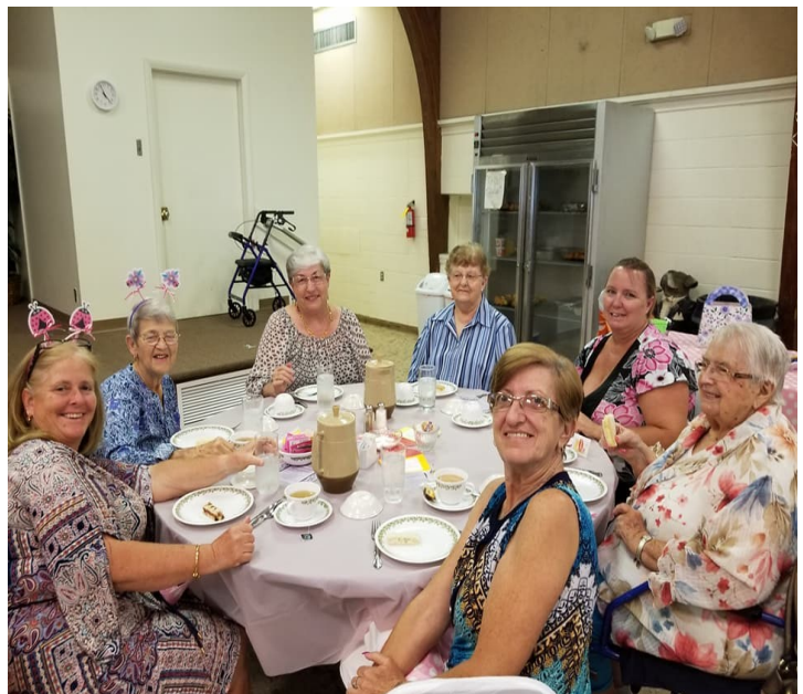
Happy Ladies at the Tea Party.